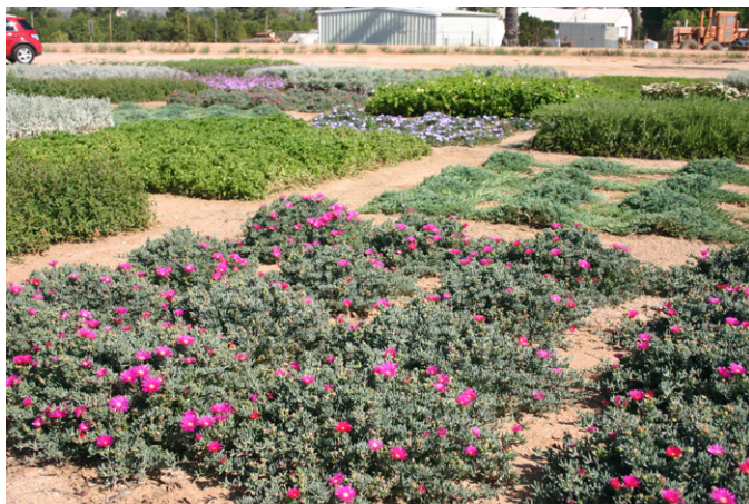
Research of water needs of landscape plants.