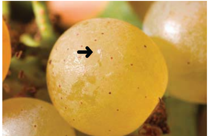
Empty, hatched egg shell of European grapevine moth.

The development of second-generation larvae in 2010 took longer than what the predictive models estimated. In Oakville we observed an overlap between the end of the larval development of the second generation and the begin-