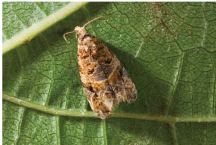
Adult European grapevine moth.

Insecticides registered for organic production are larvicidal and should be targeted for egg hatch. Due to the