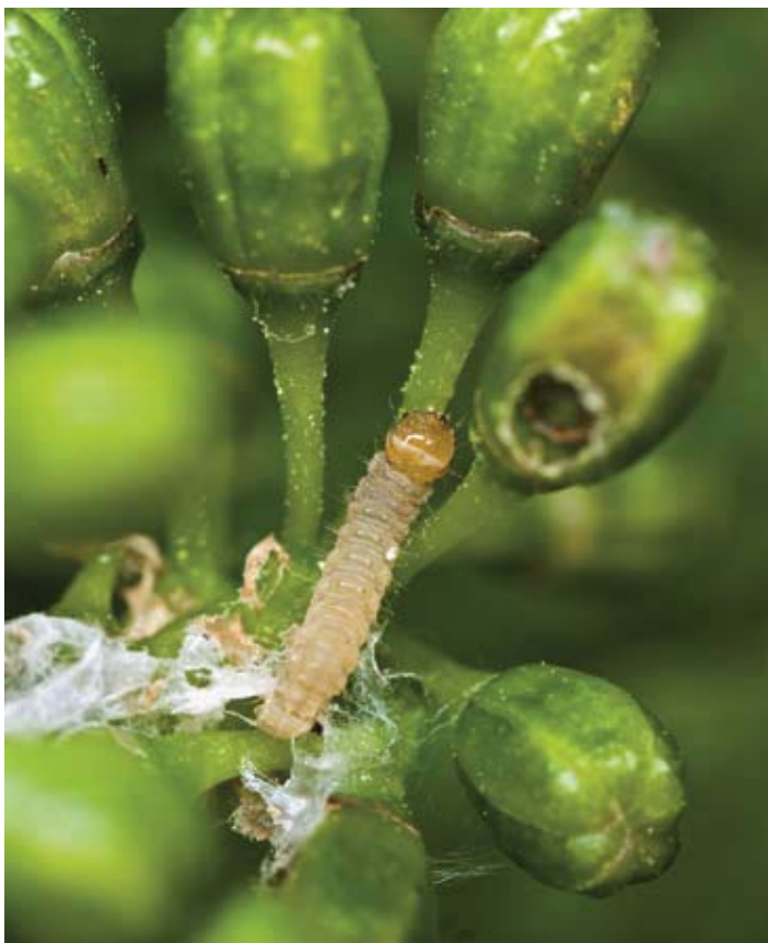
Young larva comes out of its nest to feed on grape flower cluster.

For more information, see: http://ucanr.org/NapaEGVM and http://ucanr.org/egvm&leafrollers 🍷