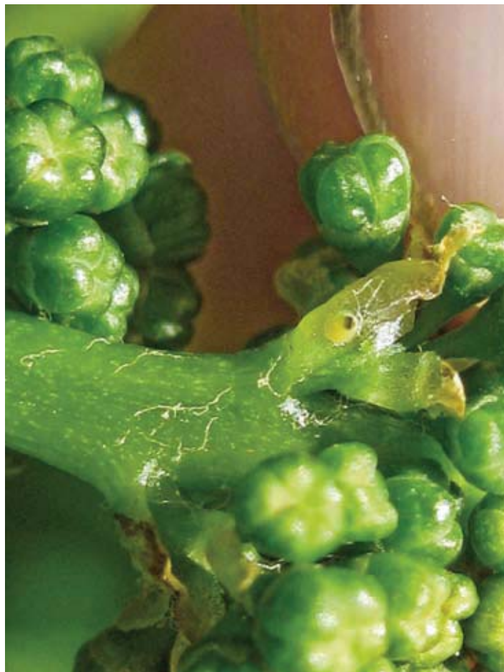
Egg of Lobesia botrana : The black head of the larva is visible through the egg shell, indicating that the larva is ready to hatch.

As soon as females began emerging, we searched for eggs in grapevines and other possible hosts. No eggs were found before bud break on grapevines or on other plants searched. Eggs were first found on or near flower clusters at the end of March when the flower cluster was about 1 inch long. The literature states that egg development during cool springtime temperatures takes between 7 to 11 days. 2010