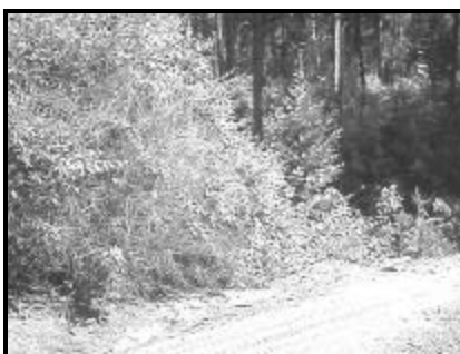
A closer look at "understory."

I was taken to a site with two paddocks. The goats had been in the first paddock for several weeks and were being moved to the adjacent paddock. The paddock they had been in had considerable brush removed. Timing of when to move was partly being based on when brush removal had reached a point when the goats would start grazing pine seedlings.