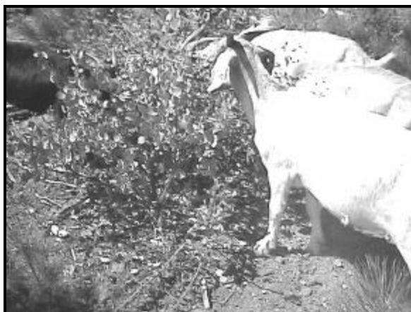
Goats being utilized for vegetation management.

Goats Unlimited is ruthless in culling with culled females going into their meat market and their males into their land enhancement projects.