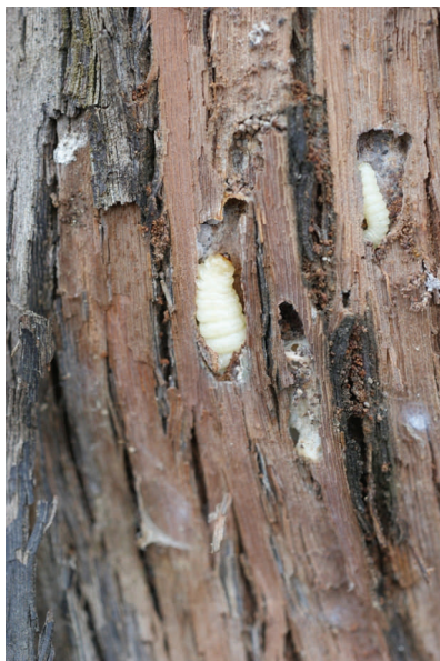
Figure 1. Givira larvae shown in holes after bark is peeled away.

Currently, little is known about the moth's biology but there are plans to do some trapping in March. Using black light traps, UC researchers hope to catch adult moths that can then be used to identify the species and give researchers a better idea of what potential management methods could be used to reduce populations. Additionally, surveys will take place to try to identify egg masses associated with this genus.