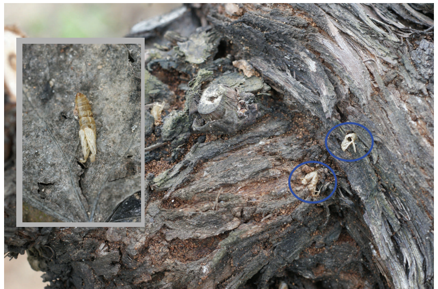
Figure 2. Adult cast left in the wood after emergence (blue circles). Inset shows adult cast pulled from the hole.