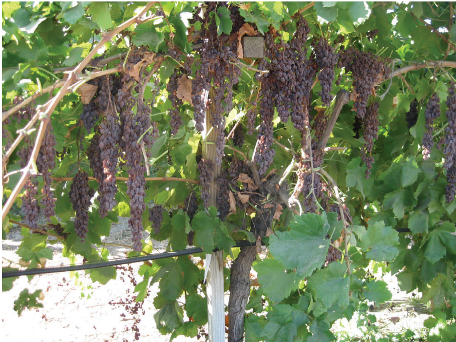
Figure 1. New natural DOV raisin.

The second generation (BC1) of seedlings for red flesh raisin grapes fruited for the first time this year. Five third generation crosses (BC2) were made this year consisting of 12,863 emasculations.