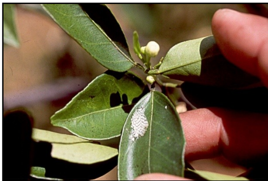
Eggs between leaves