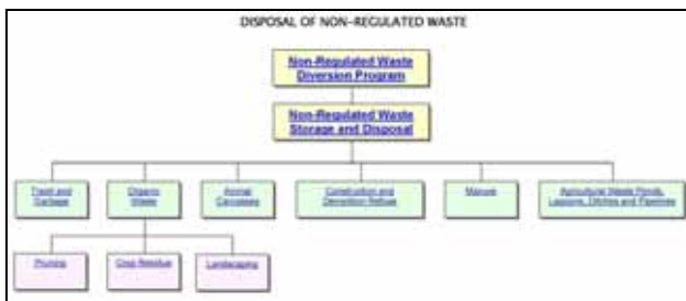
Disposal of Non-Regulated Waste flowchart

A new REC Administrative Guideline was developed for the Disposal of Non-Regulated Waste. The document provides information about recycling and proper disposal of non-regulated waste such as crop, pruning, and landscaping residue, construction and demolition refuse, animal carcasses, manure, and trash.