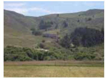
Elkus Youth Ranch Watershed

The EH&S drinking water system compliance program continued to provide site-specific water sampling and analyses schedules, spreadsheets for recording required data, quarterly and annual water system reports, and Consumer Confidence Reports for regulated REC water systems. Disinfection byproducts continued to be identified in drinking water at Desert REC and as a result, the regulatory agency directed that further testing take place to develop a plan for resolving this issue. EH&S staff will coordinate the testing program and develop the mitigation plan during the forthcoming year. As required by regulation, a five year update of the Elkus Youth Ranch Watershed Sanitary Survey was completed by EH&S staff.